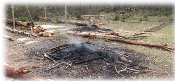
Just the smouldering piles left.