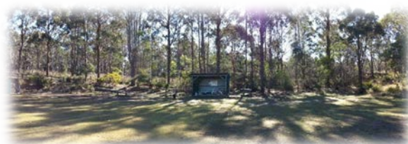
Time for the shelter and non-native blue gums to go.

Email giving Parks and Wildlife's approval to start work.