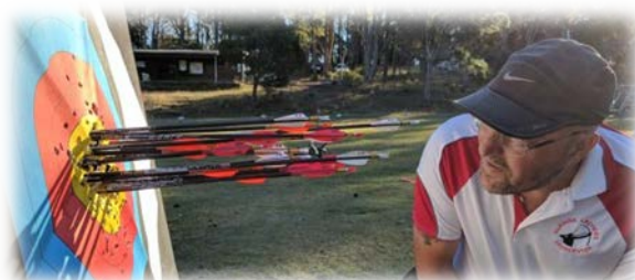
Not a bad grouping