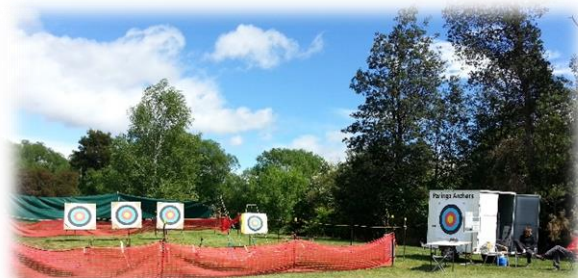
Paringa's external range setup at Deloraine.