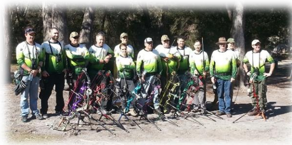
Van Diemen Archers at the Burnie field.

I had the opportunity to shoot at the Burnie Bowmen's field event at the start of October. 2 archers from Paringa, 1 from Huon, 4 from Burnie and 13 from Van Diemen Archers. Most archers camped at the Scout grounds (field location) and made the weekend a memorable one.