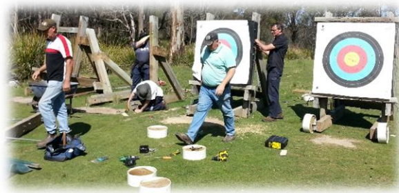
Widening the target butts and adding the wheels.

Sunday 18 th October 2015 saw a busy afternoon on the range. Three target butts were widened and had wheels added. Large hole filled in range and table tops renewed at the shooting line.