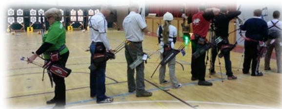
The last flight on Sunday afternoon