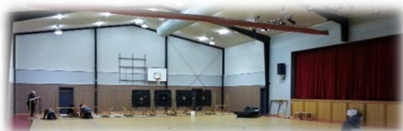
Cressy High hall being setup

Thanks to the members that helped with the setup/takedown on the weekend.