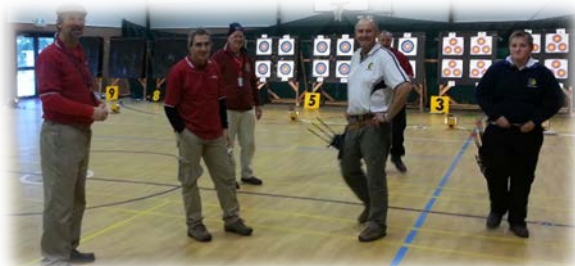
The Judges making sure all is in order