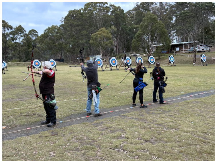
A good turnout for the 2 nd Saturday shoot

Target, Field and Indoor: 201 Reatta Rd, Trevallyn Reserve, Launceston, Tasmania www.paringa.archerytasmania.org.au