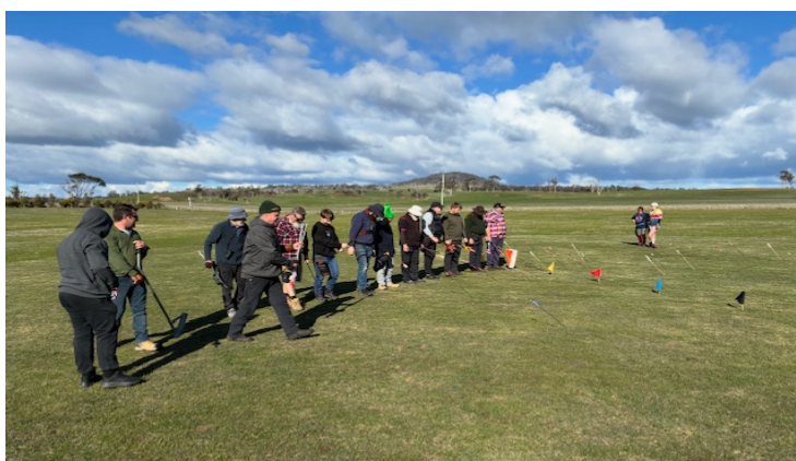
I wonder what people driving past thought was going on here!

https://archersdiary.com/ViewResults.aspx?id=062b83f02-9824-4e84-a440-03a7ffb8f30b