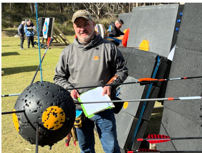
Looks like that second arrow (at top) went right through the ball to robin hood the second!

Yet again, the hanging ball claimed a couple of arrows, but also a Robin Hood – even if the arrows just glanced the ball! I suppose that is one way of stopping the ball from moving! Good shooting Dean!